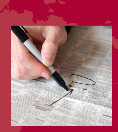
TRANSITIONING BETWEEN JOBS