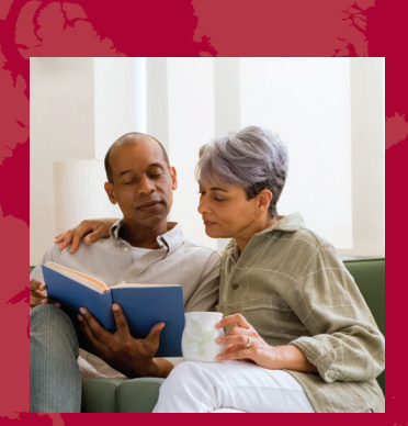
WAITING FOR MEDICARE COVERAGE