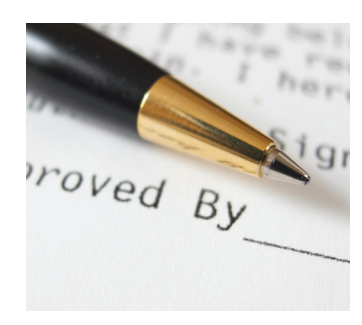
Waiting for major medical